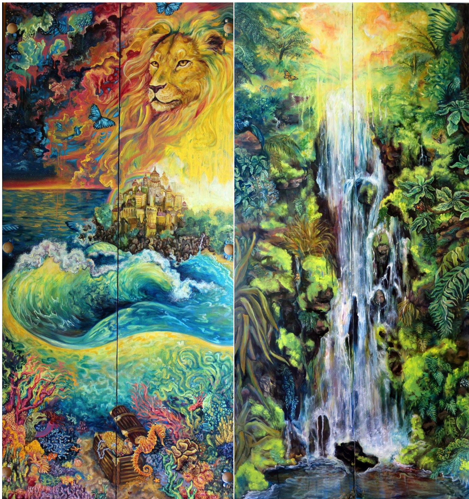
Commissioned set of wardrobe doors: interior (left) and exterior (right). Private commission, 2016. Acrylic and oil paints on wood.